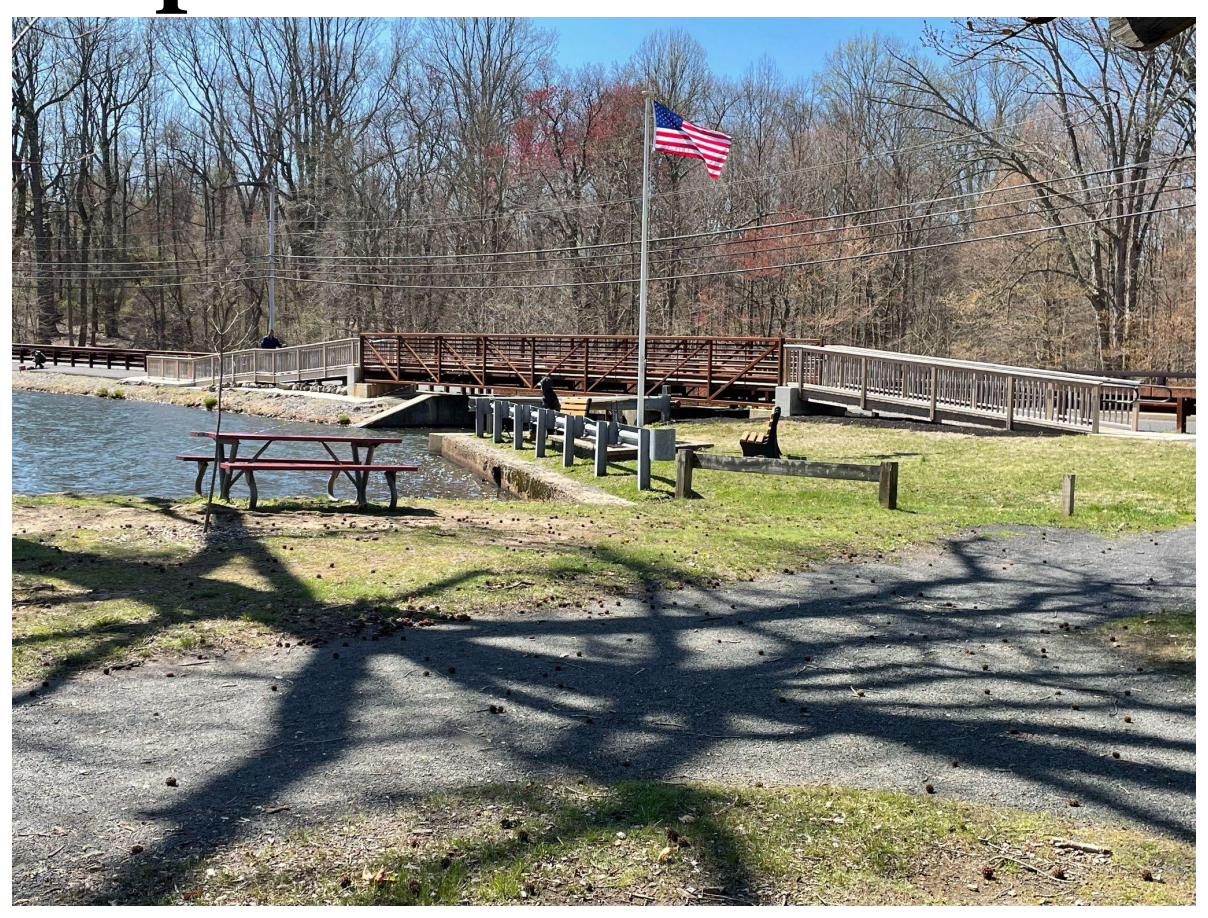
Safer access to the edge of the pond for fishing